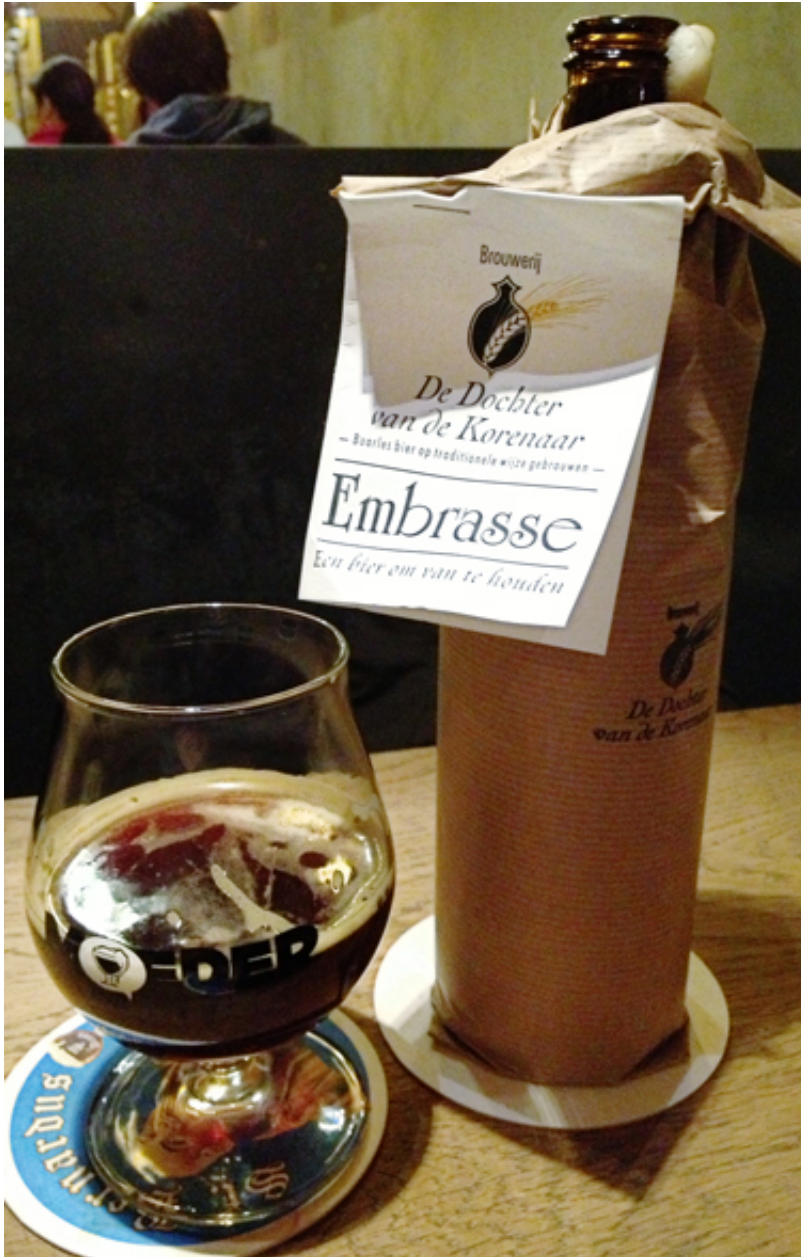
Not so hard to pronounce – Embrasse

I fail at this one. My favourite is Embrasse (especially the oak aged version) by the brewery named above. However there are some beer with names which are only pronounceable having imbibed a few first.