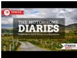
Motorhome Diaries E09 - Which motorhome to buy?